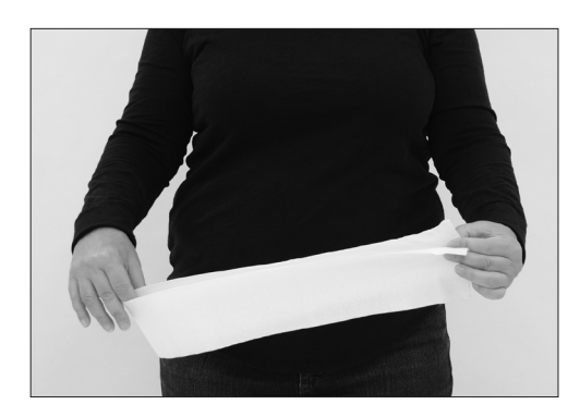
1. Select a length of toilet tissue which should be approximately 6 - 10 sheets long. Fold the length of tissue in half.