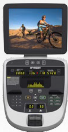
P30 Console with optional 15" Personal Viewing System